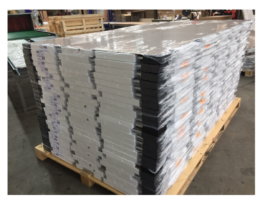
Weight Gross: 59 kg Nett:57 kg