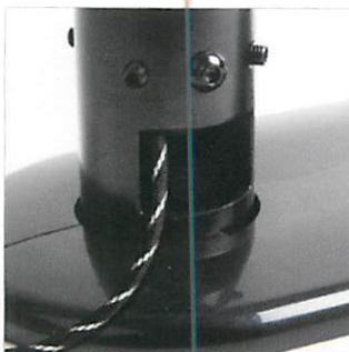
Integrated cable management to hide unsightly cables