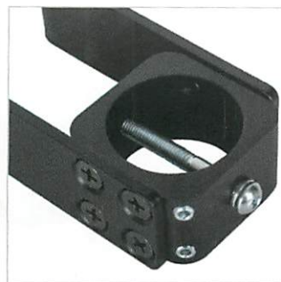
Includes safety bolt and grub screws for extra safety