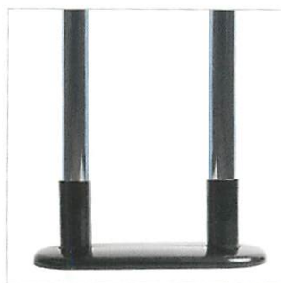
Cover plate included for a smart finish