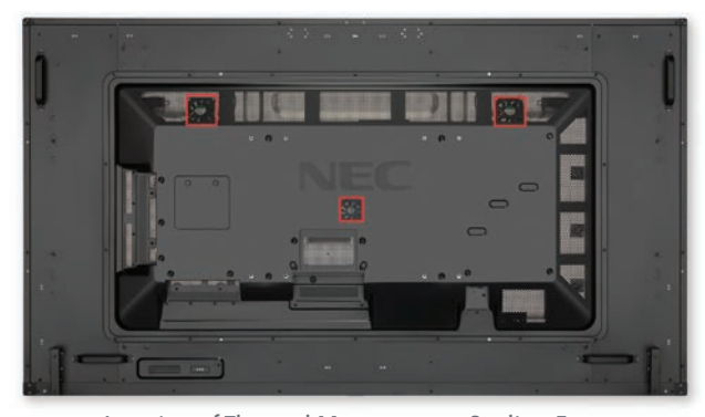
Location of Thermal Management Cooling Fans

Monitoring and managing the temperature of each display is crucial to secure reliability and longevity. An industrial-strength, premium-grade panel with additional thermal protection, internal temperature sensors with self-diagnostics, and fan-based technology allows for 24/7 operation, and protects your display investment. Without thermal management, displays can be prone to damaging heat over time. This damaging heat will lower the picture quality and life expectancy of the product. Integrated cooling fans automatically turn on and stay on when high internal temperatures are detected. These will stay on until the heat is properly dissipated and the display remains under proper temperature thresholds.